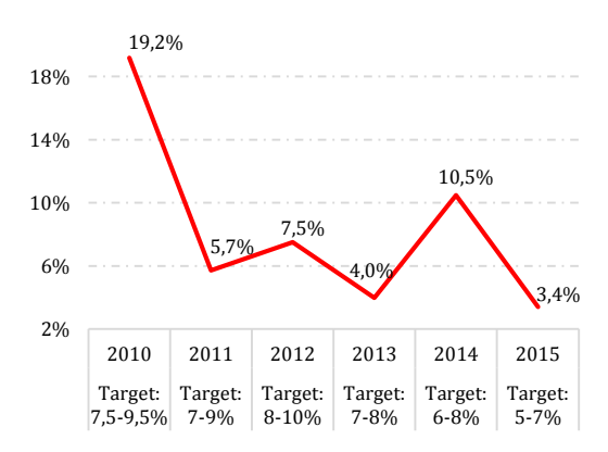
Graph 3: Actual vs. targeted inflation rate, %